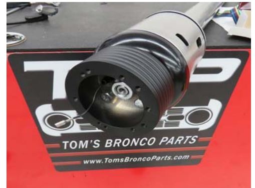
Tighten the three supplied shoulder bolts making sure not to overtighten. NOTE- Bolts will not be able to tighten all the way down, as the shoulder will catch.