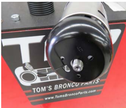
Fig 4. - Install adapter cover to column next, lining up the holes in the cover to the adapter hub.