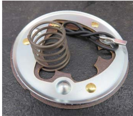
Discard these items- Not used for this application