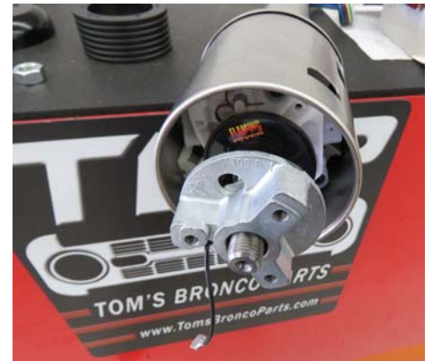
Fig 3. - Begin install by putting splined adapter hub on first.