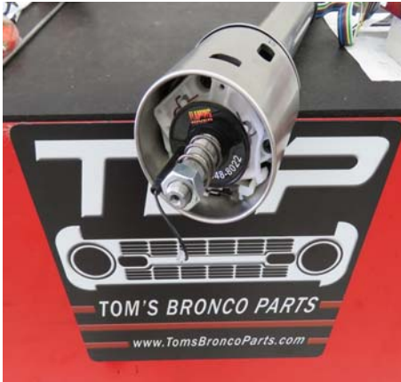
Fig 1. - Un-box tilt column and it should look like the above picture